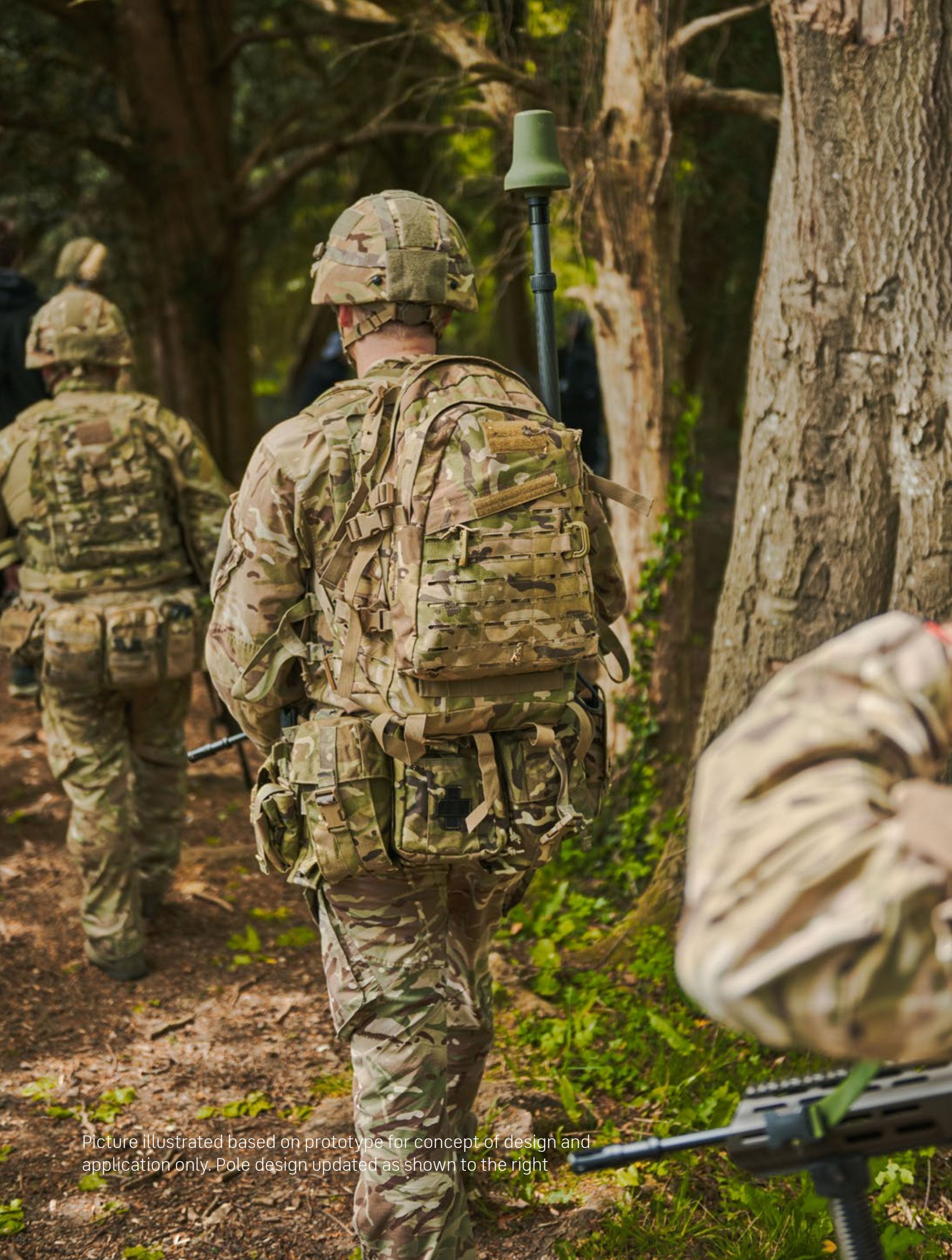
Picture illustrated based on prototype for concept of design and application only. Pole design updated as shown to the right

1m pole with flexible gooseneck top section to ensure antenna can be stowed quickly when required